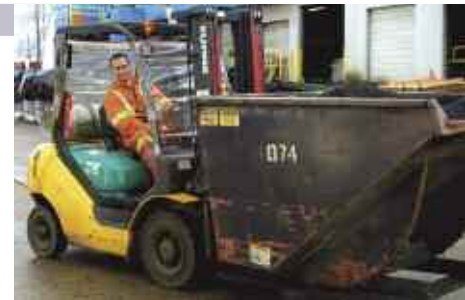
Crumb rubber processing plant

Consumers purchase new tires from retailers and pay the eco fees. Most consumers leave their old tires with the retailer for disposal.